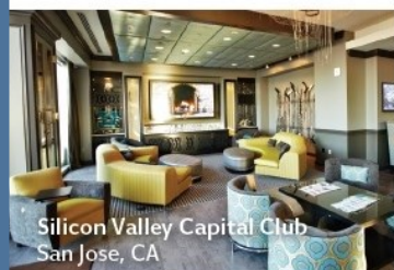
Silicon Valley Capital Club San Jose, CA

*The Signature Gold Program and corresponding benefits are subject to certain restrictions and exclusions. Reservations must be made through ClubLine for My World benefits, and are subject to availability. Participating clubs subject to change. Cart fees and guest charges may apply. Alcohol, service charges and applicable taxes are excluded. Benefits are subject to the benefit terms and conditions, which may be found on clubcorpnetwork.com . Membership application or conversion form required, and membership is contingent on successful completion of the Club's enrollment process. All offers are subject to availability. Other restrictions may apply. See Club for details. © ClubCorp USA, Inc. All rights reserved. 27304 0315 BE