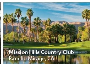
Mission Hills Country Club Rancho Mirage, CA