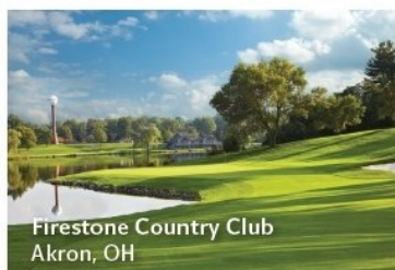
Firestone Country Club Akron, OH