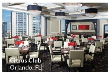
Citrus Club Orlando, FL